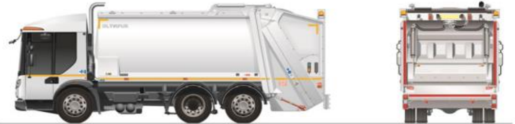
26 tonne Dennis Eagle Olympus (Residual Waste, Garden Waste)