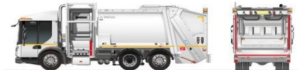
26 tonne Dennis Eagle Duo (Residual/Food - Flats)